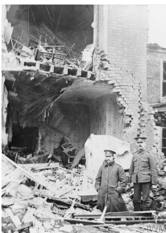
Two British soldiers ,Gt Yarmouth In front of building damaged by a Zeppelin raid, 19 th January 1915.