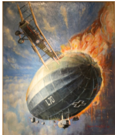
Painting displayed at Time & Tide Museum depicting Zeppelin being shot down.

The Zeppelin was a type of rigid air ship first developed by German Count Von Zeppelin. It made its first air flight from Germany on July 2 nd 1900.