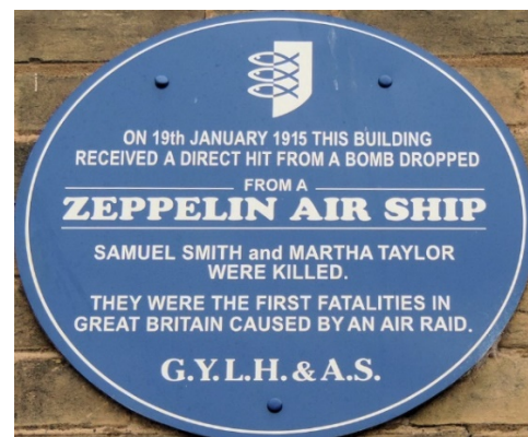
Blue Plaque, St Peter's Plain